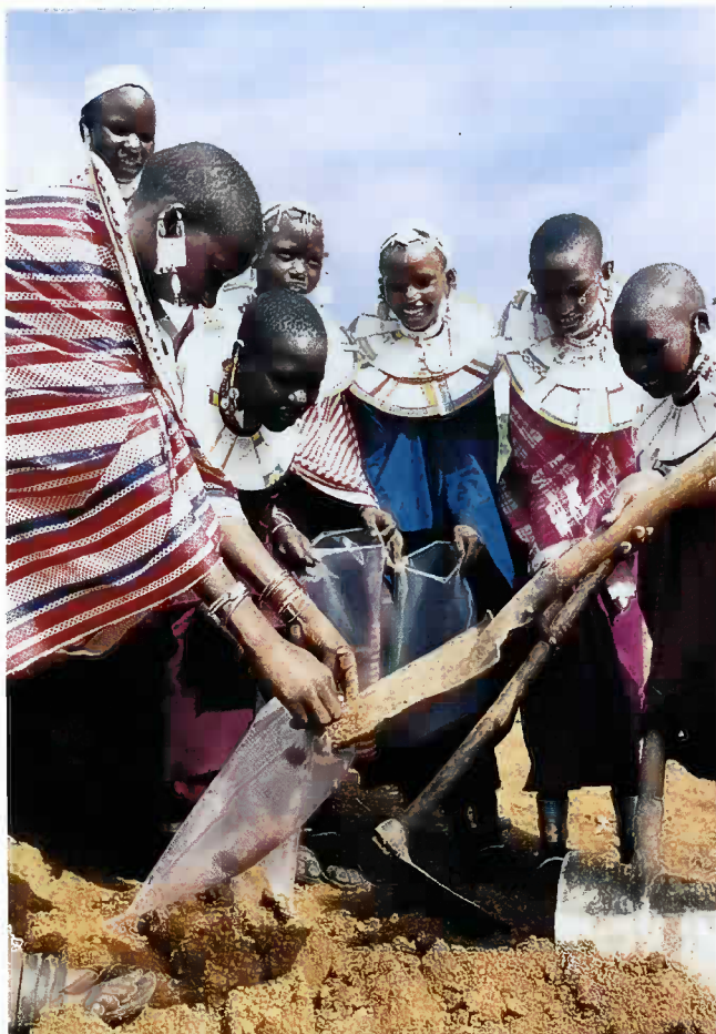
Clay was collected at Ngorogoro Crater by children from Olarobi, Tanzania.