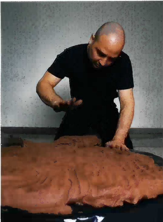
The contributed clays were mixed by Standard Ceramics of Pittsburgh, then formed by hand and foot into a large disk in the General Assembly Visitor's Lobby at the United Nations headquarters in New York City.