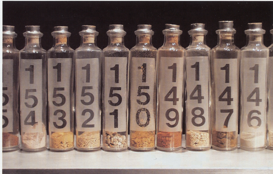
Installation 188, 2000, detail, 300" x 48" x 48", aluminum, glass, cork, clay and sand

hunger, issues about how all of humanity is interacting with each other in terms of wealth, power, military." The work is a symbol of the world's community of communities. The project has been featured in several museums and publications and includes a catalogue.