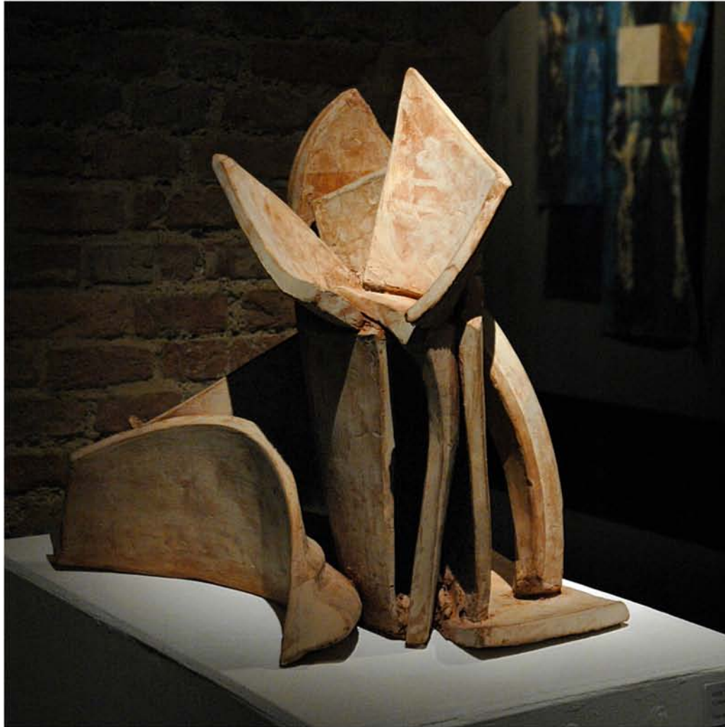
Deconstructed Vessel 1, 2009