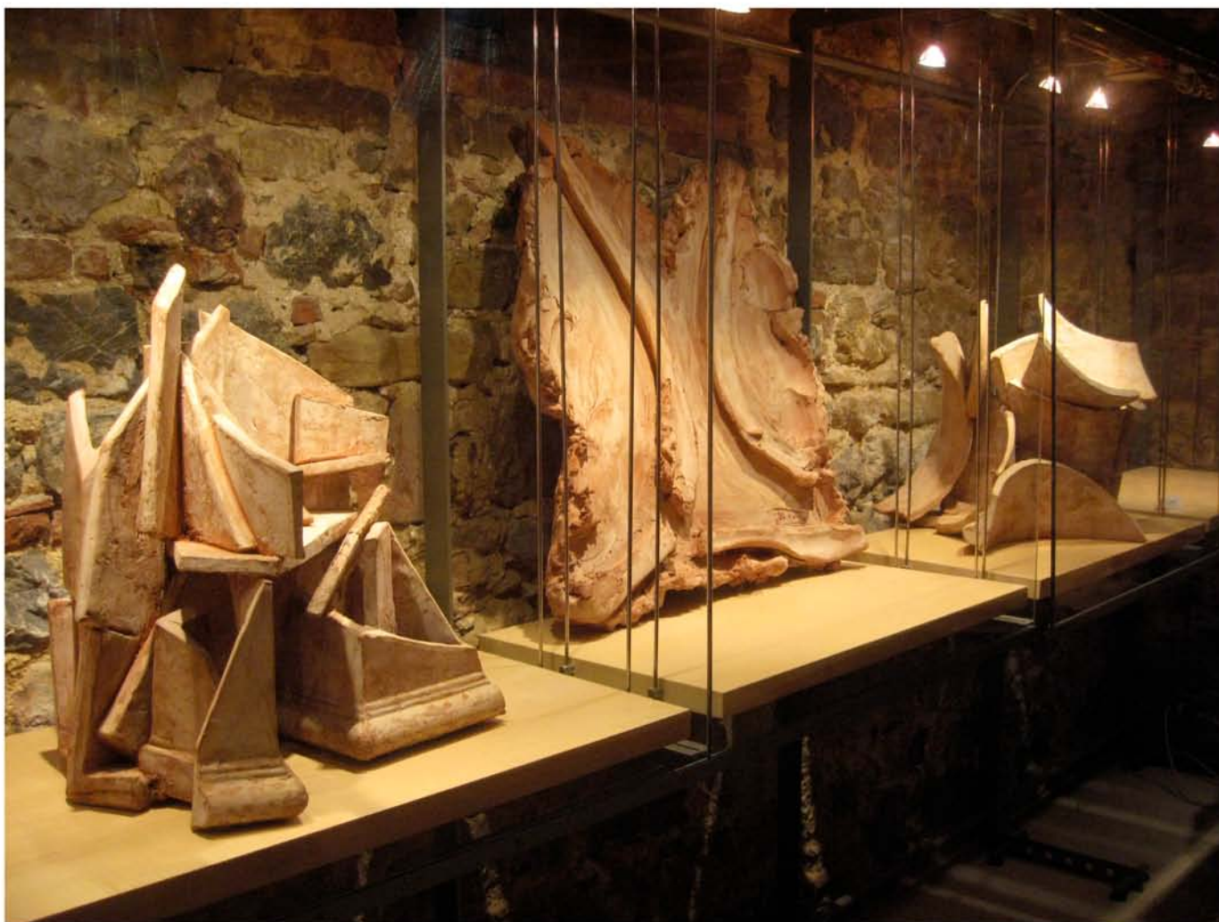
In January of 2010 the exhibition of work I had made during the summer opened at the Museo della Terracotta , Museum of Terracotta in Petroio.