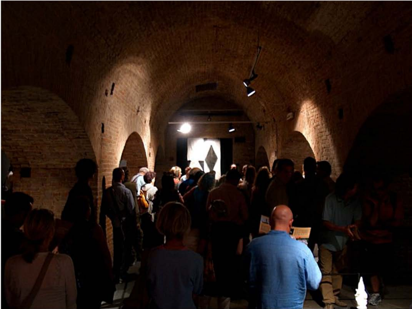
Siena - New York, opening reception, July 18, 2011 at the Palazzo Pubblico .