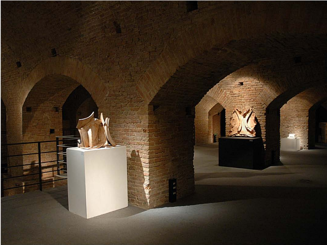
The expansive galleries within the Palazzo Pubblico are unlike a typical American gallery or museum with white walls. The splendid brick arches were crafted 800 years ago.