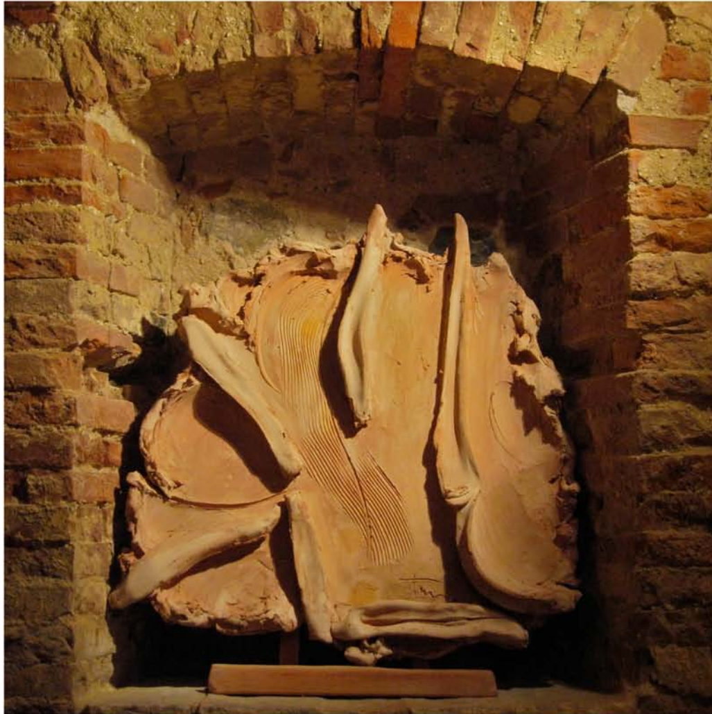
The antique brick architecture of the museum in Petroio enhanced the presentation of the terracotta artwork.