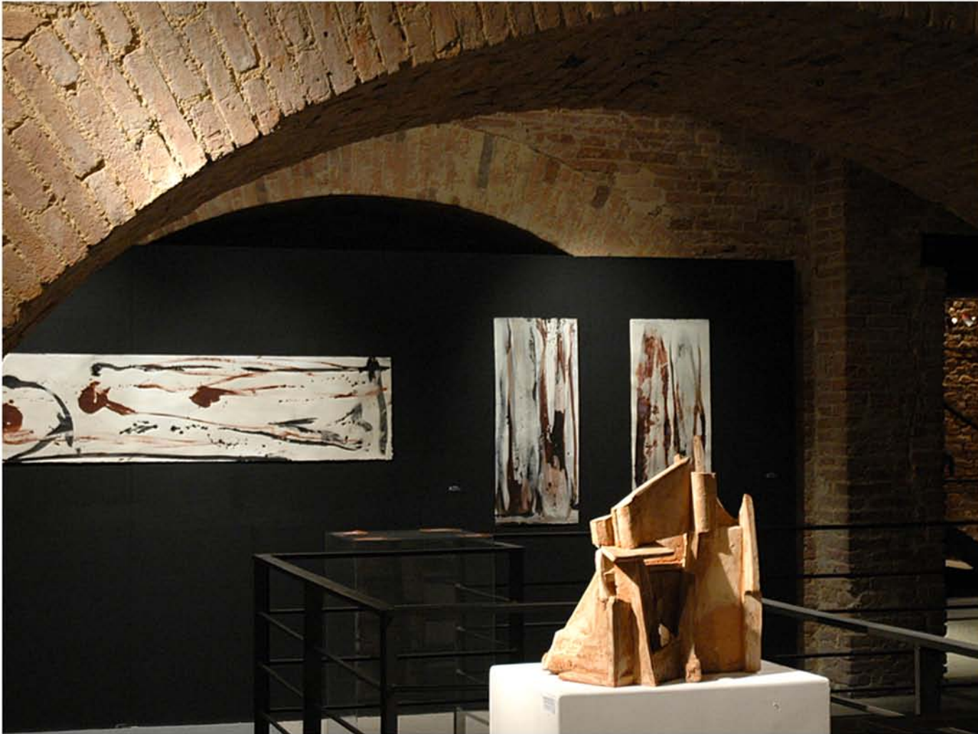
Deconstructed Vessel 2, 2009 with Oil & Water Series, 2011.