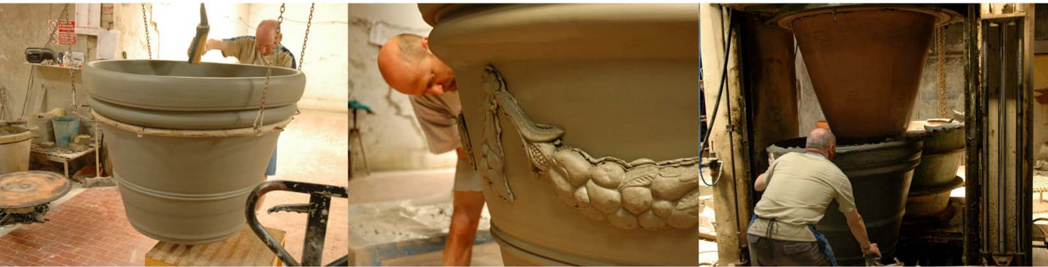
The Cresti Terracotta Factory