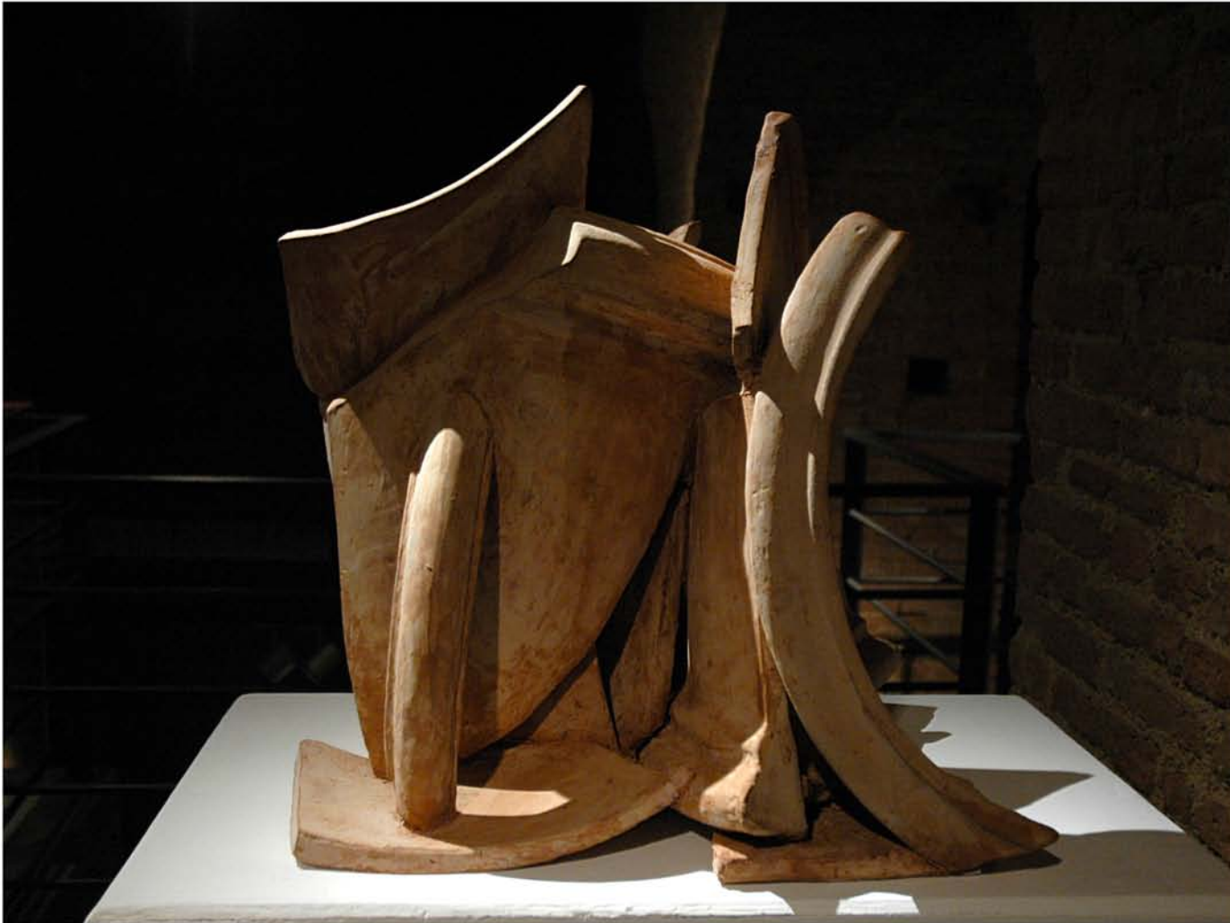
Deconstructed Vessel 3, 2009