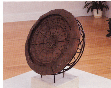
World Mandala Monument maquette, 1999, bronze, ceramic with marble base, H: 24"

The Common Ground World Project is officially endorsed at the United Nations by the department of Economic and Social Affairs. The project is made possible by the