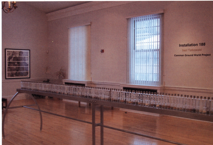
Installation 188, 2000, on view in the Museum gallery in Binns-Merrill Hall through Friday, April 2nd